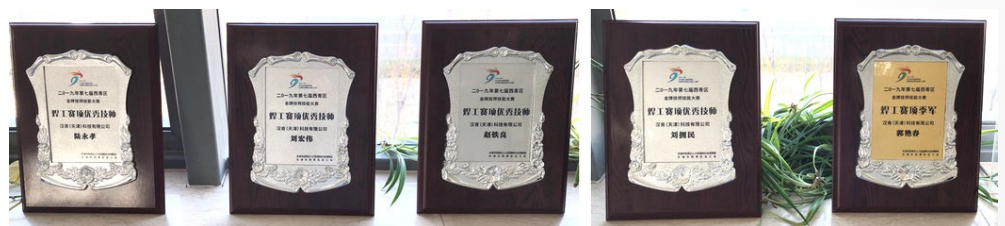
Welding skill award