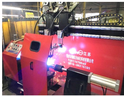
Automatic Welding Machine