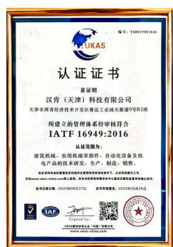
IATF16949 Quality Certification