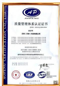
ISO9001 Quality Certification