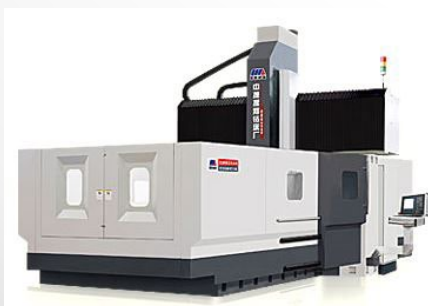
CNC Machining Center