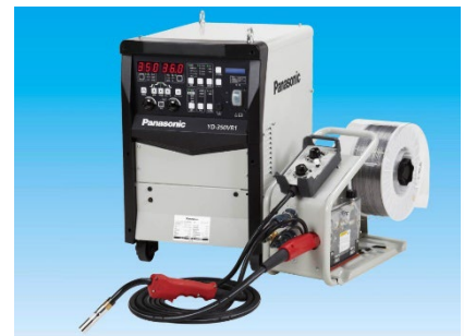
Welding Machine (Digital Controlled)