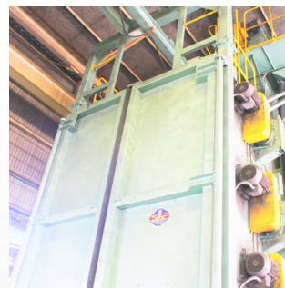
Shot Blast Machine