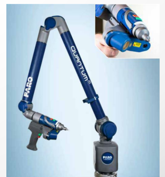
3D Measurement Instrument (FARO)