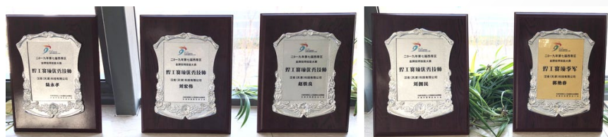
Welding skill award