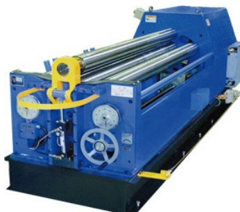
CNC Bending Roll