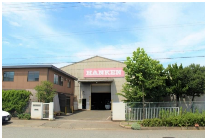
Head office and Factory (Akashi, Japan)