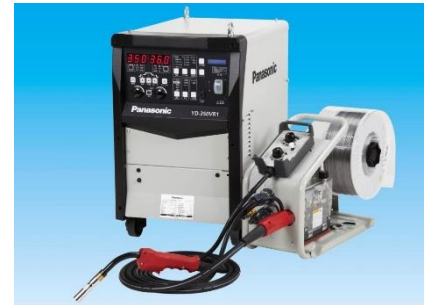
Welding Machine (Digital Controlled)