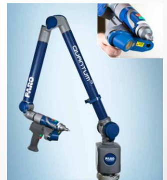
3D Measurement Instrument (FARO)