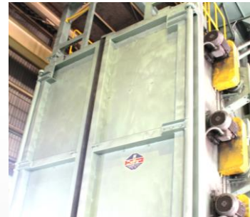
Shot Blast Machine