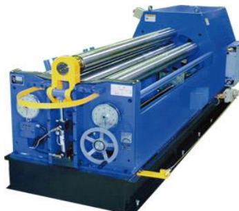
CNC Bending Roll