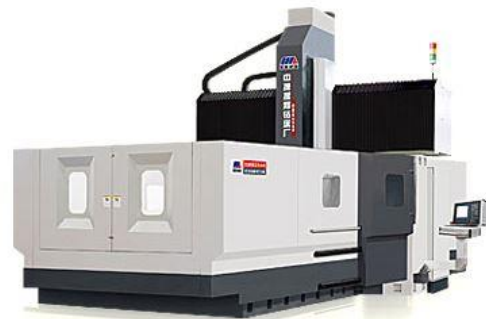
CNC Machining center